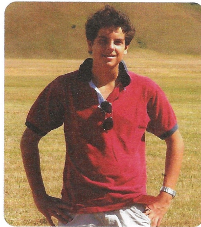
Blessed Carlo Acutis (1991–2006) served the needy and built an internet gateway for exploring eucharistic miracles.